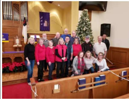
Decorating the campus