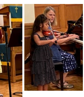
(August 2022 Showcase)

Planning has begun for the next academy session which will start in mid-January.